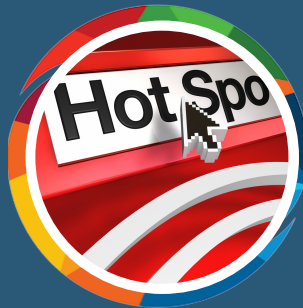
Know Your Hotspots