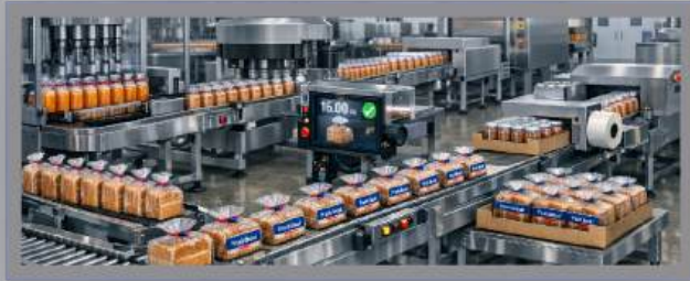
Food & Drink (Hygienic Design)