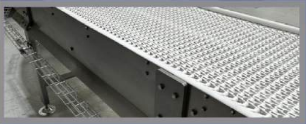
Bespoke-Engineered Designs: Site-specific builds tailored to unique facility constraints and complex product geometries.