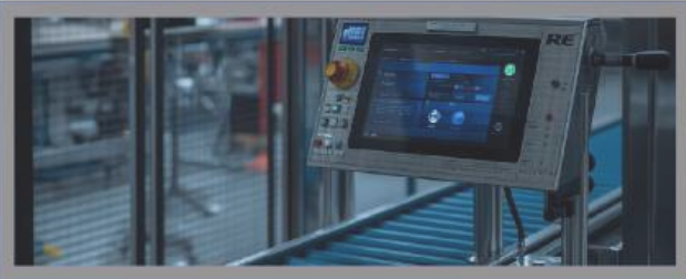
Material Versatility: Available in anodised aluminium profiles, high-grade stainless steel , or powder-coated mild steel.