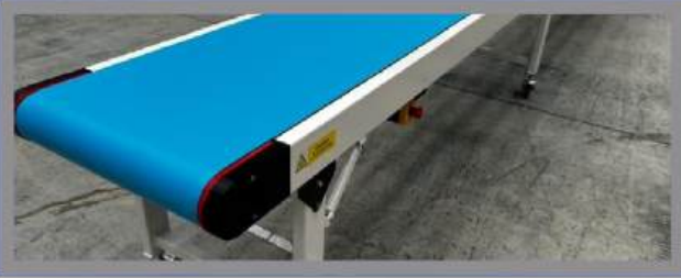
Standard Modular Systems: Cost-effective, pre-configured solutions for swift implementation.